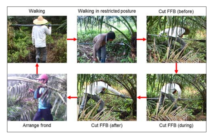
Figure 1. A single cycle of work tasks for FFB cutter

On the other hand, a single cycle of FFB collector's job tasks were to lift the detached FFBs, collect loose fruits onto a wheelbarrow, and unload them along loading collection route on the oil palm plantation. Depending on their tasks distribution with FFB cutter, FFB collector sometimes arranges the severed fronds in stacks (Fig. 2).