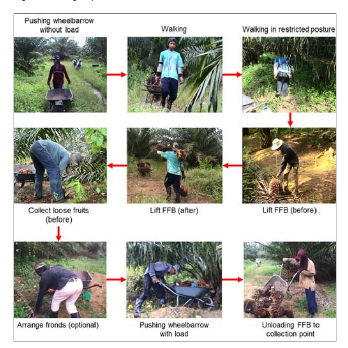
Figure 2. A single cycle of work tasks for FFB collector

The translated and pre-tested questionnaire, including the Nordic Musculoskeletal Questionnaire, was administered in the evening using interviewer-assisted strategy, when workers returned from the oil palm plantation their hostel. Each interview was accompanied by anthropometric measurements to record each respondent's height and weight.